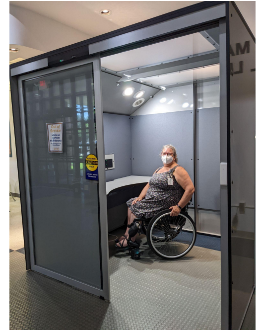
Charlotte Hall Library telehealth booth