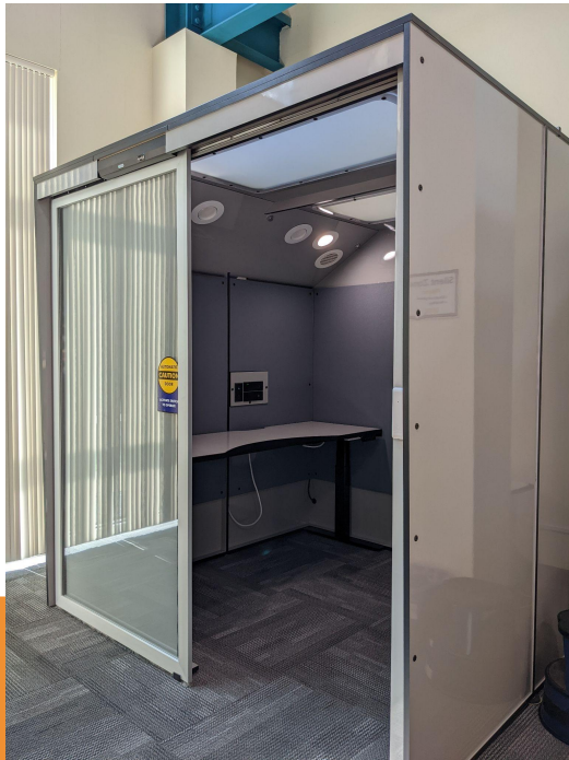
Lexington Park Library telehealth booth