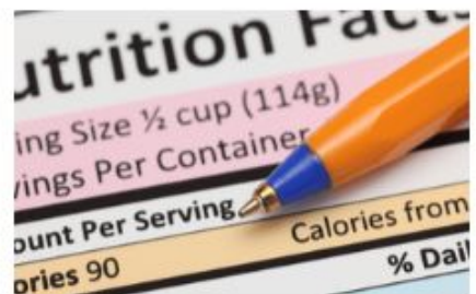
Get the Facts