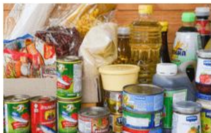
Stock Up on Staple Foods