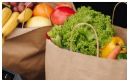
Enjoy More Fruits and Veggies