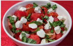
Watermelon and Tomato Salad