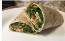
Swiss Chard Wraps