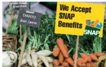
SNAP Benefits Help Families