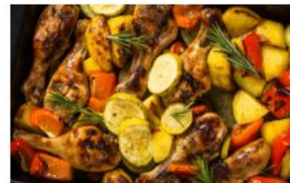
One Pan Meals