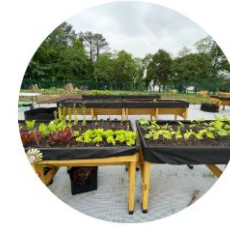
Standing Beds ADA Accessible $15/year - 3x5 (15 sq ft)