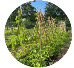
In Ground Plots Half Plots - $50/year approx. 4x20 (~80 sq ft)

You are eligible for a FREE plot if you use: SNAP EBT, WIC, Medicaid, or Free or Reduced School Lunches