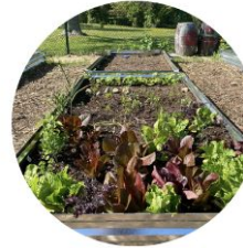
Raised Beds $20/year 4x8 (32 sq ft)

Starting Nov. 4th @ 9am - Continuing through Nov. 30th