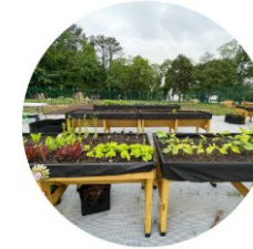
Standing Beds ADA Accessible $15/year - 3x5 (15 sq ft)