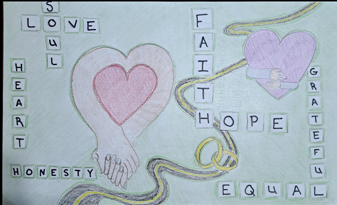
By Kelly Peterson Adult Category- 3 rd Place